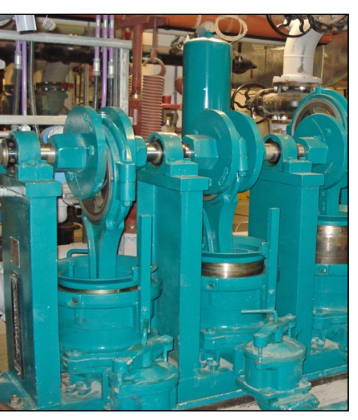
The guided stuffing box assembly is increasingly specified by Consulting Engineers for new plunger pump projects like this one at a wastewater treatment plant upgrade.

Wastecorp also employs full length guide bar rollers that capture the entire stroke length of the plunger. Tolerances are set to Wastecorp's 0.0015" nom. No lubrication is required, allowing the rollers to last up to 200 times longer than conventional guide shoes and greatly extending packing and plunger life.